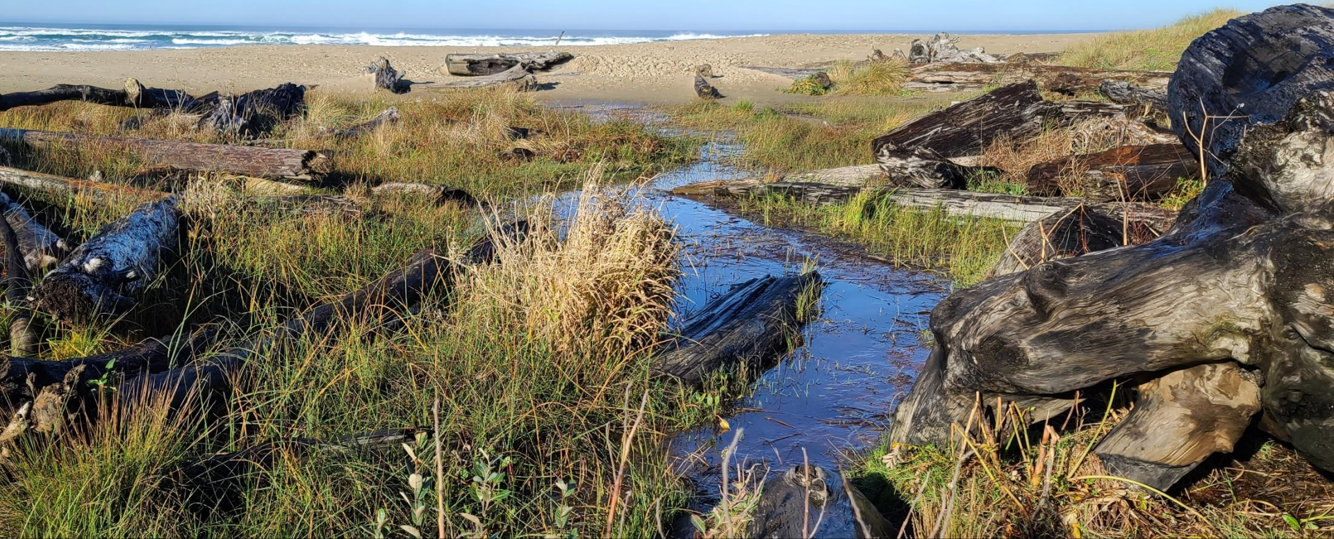
Taken four miles north of Florence OR, yesterday.